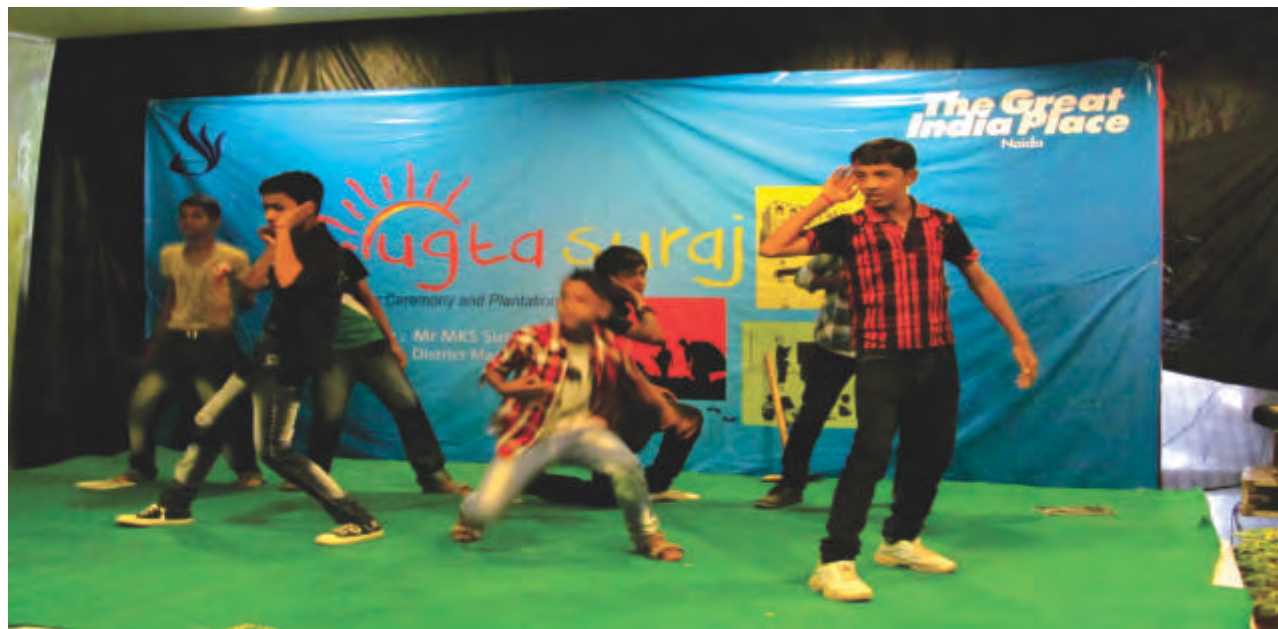
Ugta Suraj children performing at The Graduation Ceremony 2011-12