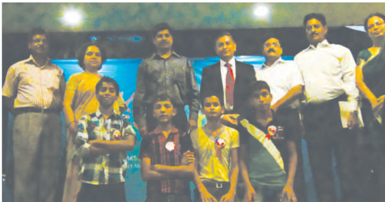
Graduation Ceremony 2011-12, The Great India Place, Noida