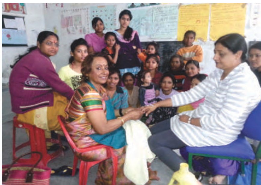
Beauty Class in Progress ... Nithari Centre

Club. She gave live demonstrations followed by hands-on practice by the trainees. Around 10 women and young girls were trained in beauty procedures such as Henna Application, Manicure and Pedicure. The trainees were provided Working Kits containing Colouring brush, Tail comb, Henna, Gloves, Shampoo, Cream, Pedicure and Manicure tools.