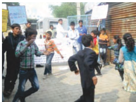
Children perform Nukkad Natak

After puja, all left for home with sweets looking forward to extended celebrations at home.