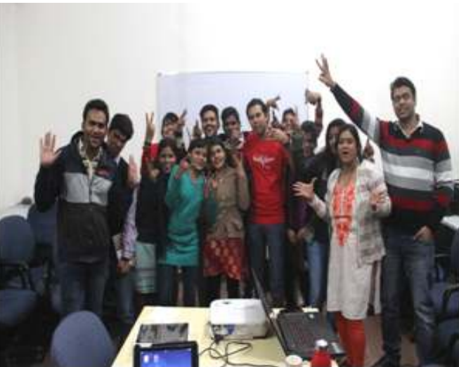
MAST Batch I students