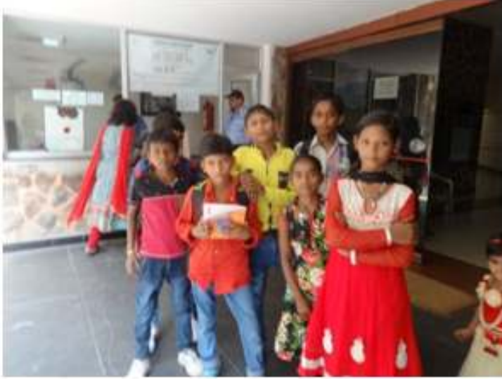
▲ When Learning is an Enjoyment

Visit to Planetarium and Rail Museum: On 20 October 2015, Ugta Suraj children visited Nehru Planetarium and Rail museum in Delhi. The aim of the visit was for the children to learn about space, planets and stars. They watched a documentary film on Our Universe. They went around to see different models on space.