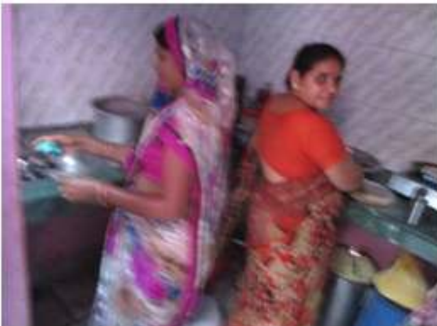
Commercial Promotion of SHG products