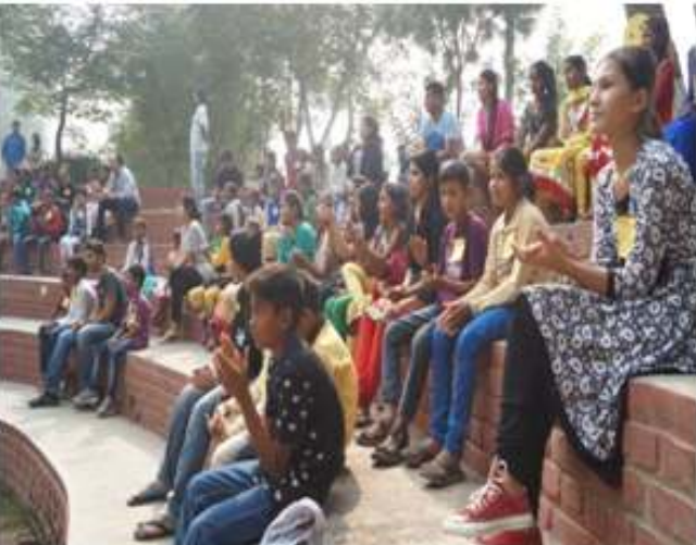
▲ Fun Time - Masti Time at IMT

The IMT team planned a lot of activities for the children that ranged from magic show, sports, dance and singing programme, colouring and painting etc. The cake cutting ceremony stole the show and the children were very excited to have their share of the big and creamy cake.