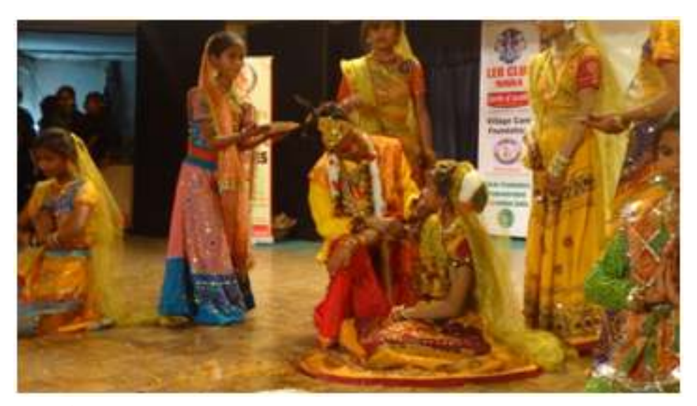
▲ Ugta Suraj children performing at Vasant Mahotsav

• Exploring the Writing Skills: AyounginternfromtheDepartment of Social Anthropology, Amity University, Noida interacted with Ugta Suraj children in the month of February 2016. She conducted a lot of workshops for the children through a participative and interactive mode. On 25February, 2016, she conducted a drawing competition for the children who enthusiastically painted beautiful pictures and presented them for an appreciation. Later, an exercise was undertaken to assess the learning and performance levels of Ugta Suraj children through poem recitations and story telling.