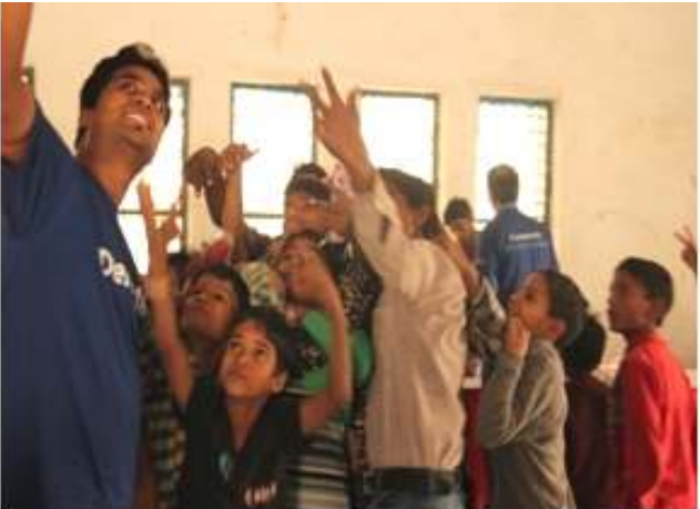
Children with their long time Friends