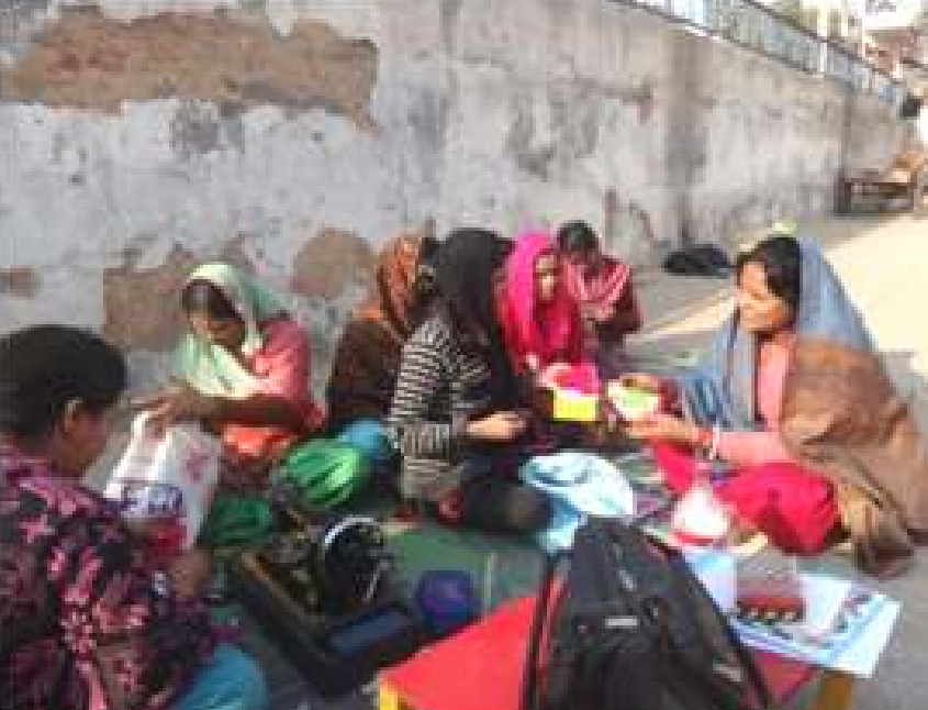
A Sarthak: Chatting and Learning happen Side by Side