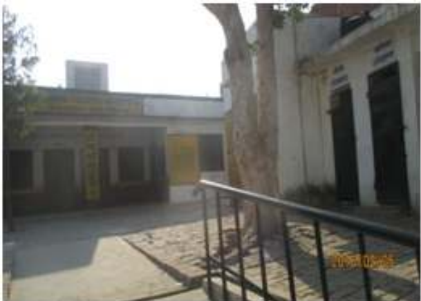
🛕 Glimpses of GaonMera: Village Saunda