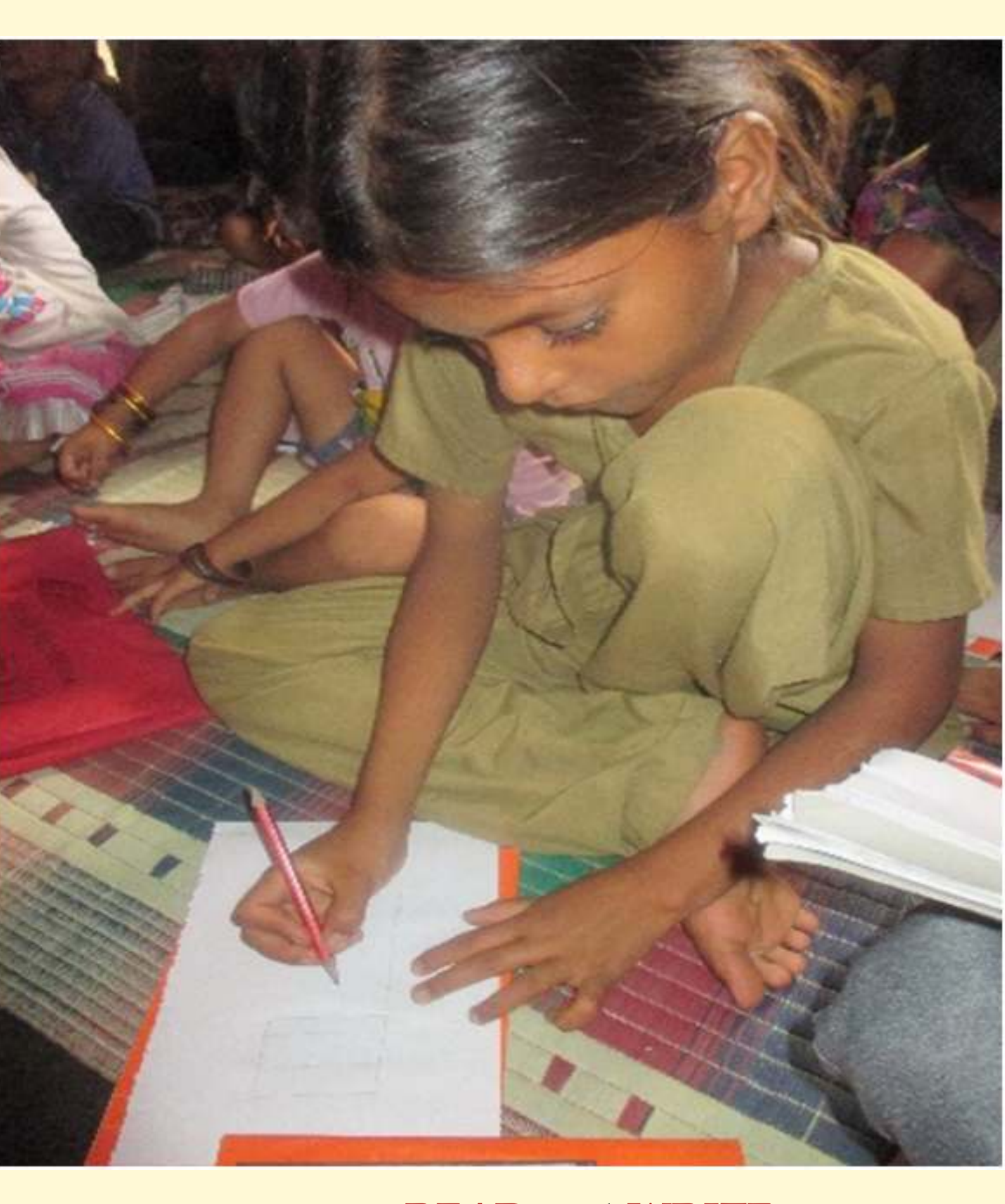
I want to READ and WRITE!