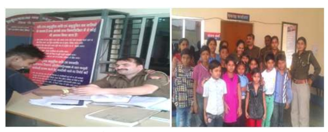
▲ Children are Friends with Police

The police station at Knowledge Park, Greater Noida beamed with children on the bright morning of 16 November. The Child Line team members and the construction workers children reached the police station with Dosti bands. The children tied the bands on the wrist of Police Station Head and other police officials.