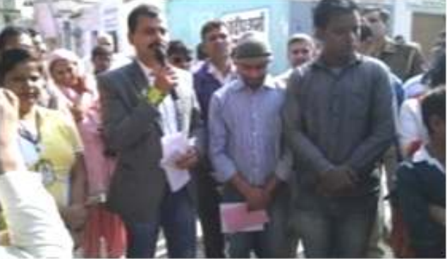
Children in Street Play SDM exercising Child Protection Oath