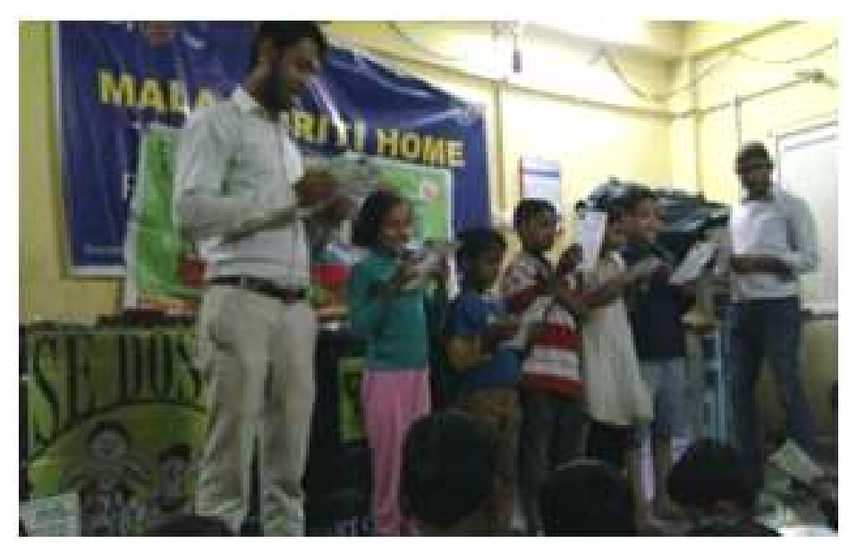
▲ Open house in the Children Home

The same day, on 20 November, the Childline members of District GautumBudh Nagar including that of Sub-centre Greater Noida and Collaborative organization, Noida held an Open Session in Malasmriti Child Home situated in Khoda colony, Noida. The children were told about how the children may be physically or verbally abused and what should they do in case they feel uncomfortable in any such situation. The Home's caretaker and support staff were present in the Open House and learnt about the Child Line services.