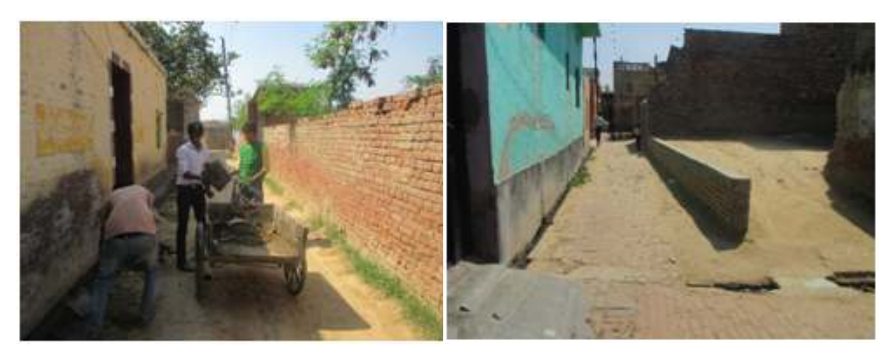
🛕 Cleaning of Village Lanes Clean Village lanes