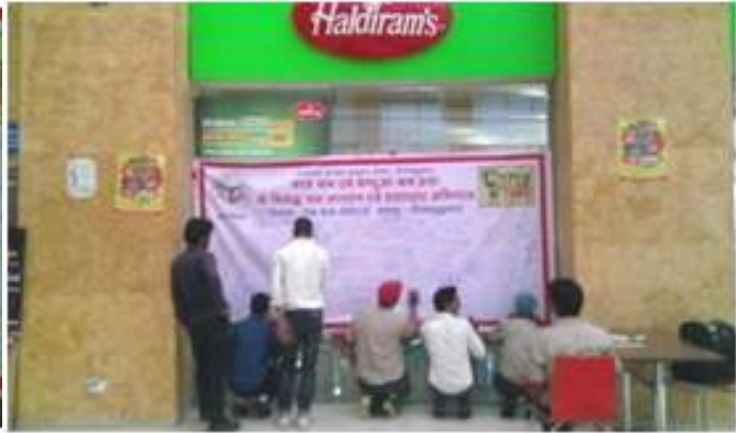
🛕 Signature Campaign against Child Labour & Bonded Labour

shared the awareness information among all those who were present in the Mall. The Campaign went on for the whole day.