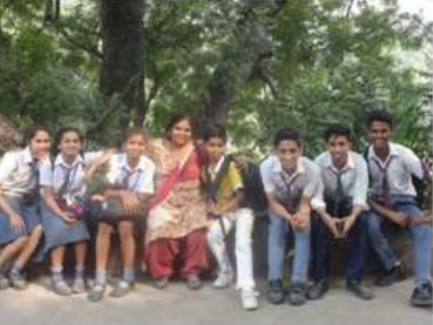
🛕 First Hand Learning for VidyaRatna