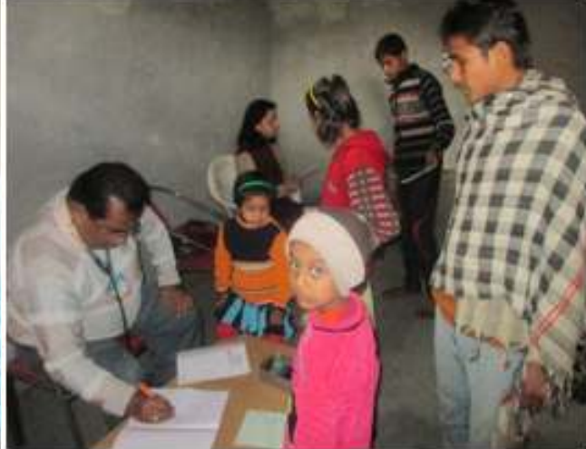
Health Camps in Progress!