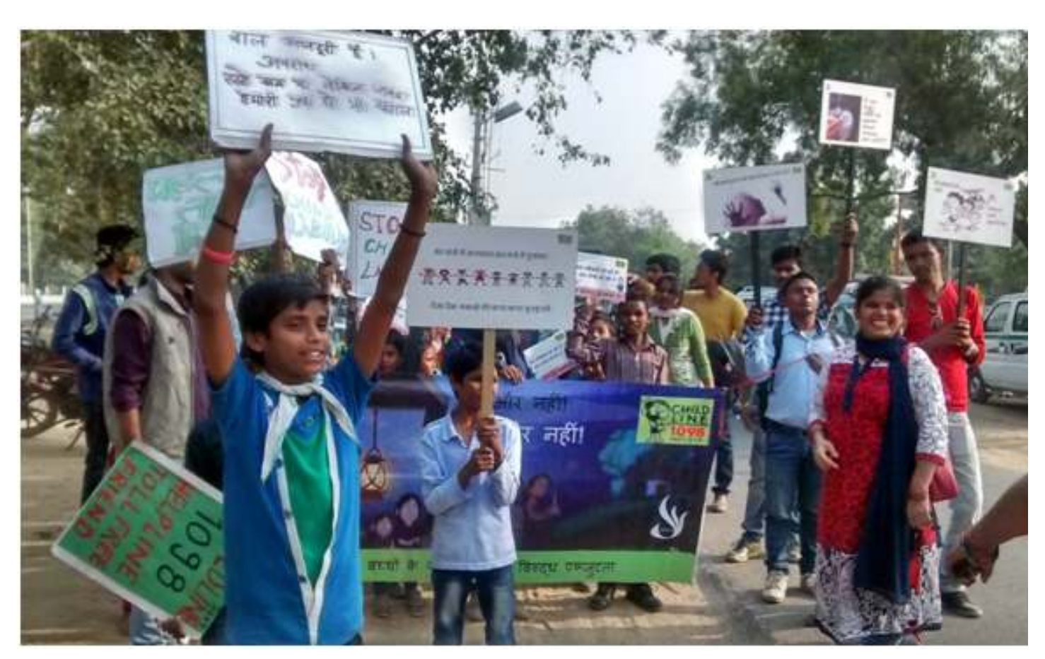
Rally against Child Abuse