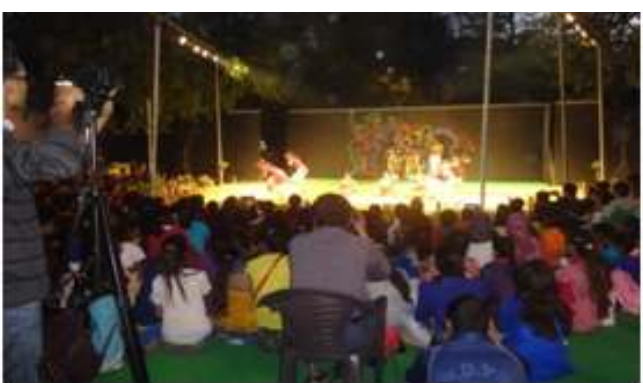
▲ An enjoying Bus Ride The Regional Dance show

• Impact Day celebration: The Gurgaon based Corporate, Deloitte Group of Companies celebrated Impact Day, with Ugta Suraj children. On 27 November 2015, around 35 Deloitte volunteers reached Nithari centre to engage with children in various fun activities.