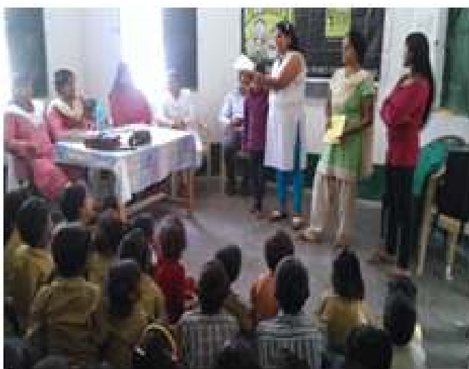
▲ Open House in Progress