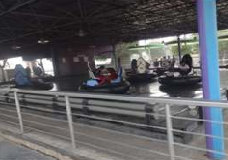
🔺 Each Ride is equally Joyful

The children rushed for the rides and the entire place thundered with their joy and laughter. Time had no limit that day. The children had to be pushed out of the Park since none of them was willing to leave the place. Unwilling, children returned to their homes, tired but happy.