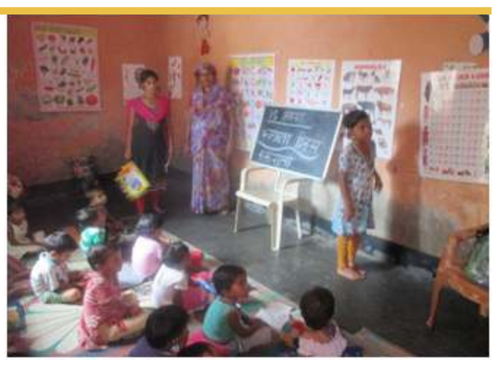
A Colorful and Lively Balwadi

A total of 6 Balwadis worked during the year with a total of 160 children out of which 46% per mainstreamed at the end of