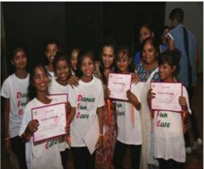
Performance by Children on Stage

• Health check-up for the community: Under the Corporate Social Responsibility initiative, the D.S. Group, Noida organized a general health camp for community people on 30 June 2015. The local community people visited the camp held in Barat Ghar, village Nitthari. The camp was led by the team of a doctor and aHealth Assistant. The doctor checked the basic health parameters like height, weight, and blood pressure for around 20 adults comprising men and as well as women. He screened the people for signs of nutritional deficiencyand iron. He gave away vitamin supplements to those who showed nutritional deficiencies. He also gave away common medicines for minor ailments like cold and cough.