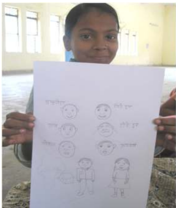
Would you hear my story!

medium of drawing and made it a fun yet a learning experience for them. They asked children about what they see or feel in their day to day lives and asked them to draw some pictures. They also made some easy sketches using the shape of circle which the children could easily draw. All the students were given pencils and scales at the end. AT the end of workshop, personal stories of many children could be seen drawn on paper.