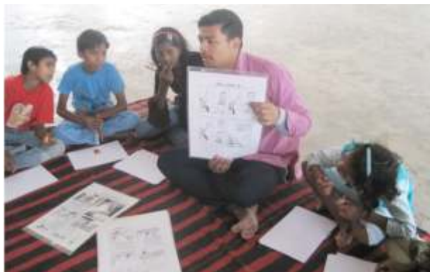
The Comic Workshop: Lets all write our stories

medium of drawing and made it a fun yet a learning experience for them. They asked children about what they see or feel in their day to day lives and asked them to draw some pictures. They also made some easy sketches using the shape of circle which the children could easily draw. All the students were given pencils and scales at the end. AT the end of workshop, personal stories of many children could be seen drawn on paper.