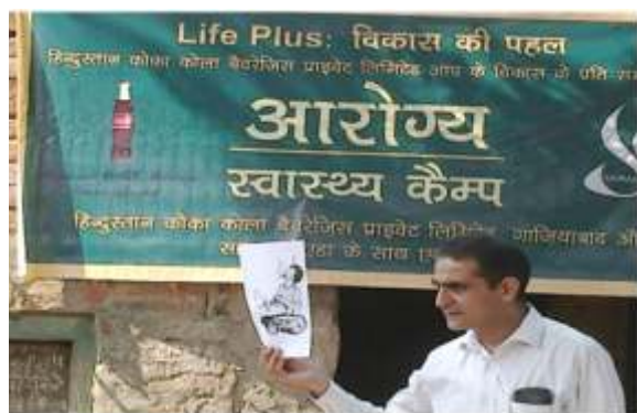
Making available quality medical services in the communities.....

SADRAG has been engaged in the rural development program, Life Plus - Vikas Ki Pehal in partnership with Hindustan Coca Cola Beverages Private Ltd. The program is operational in Dasna block in district Hapur, U.P. The main aim of the program is to improve the quality of life of people in four local rural communities in village Kakrana, Galand, Poothi and Nandpur.