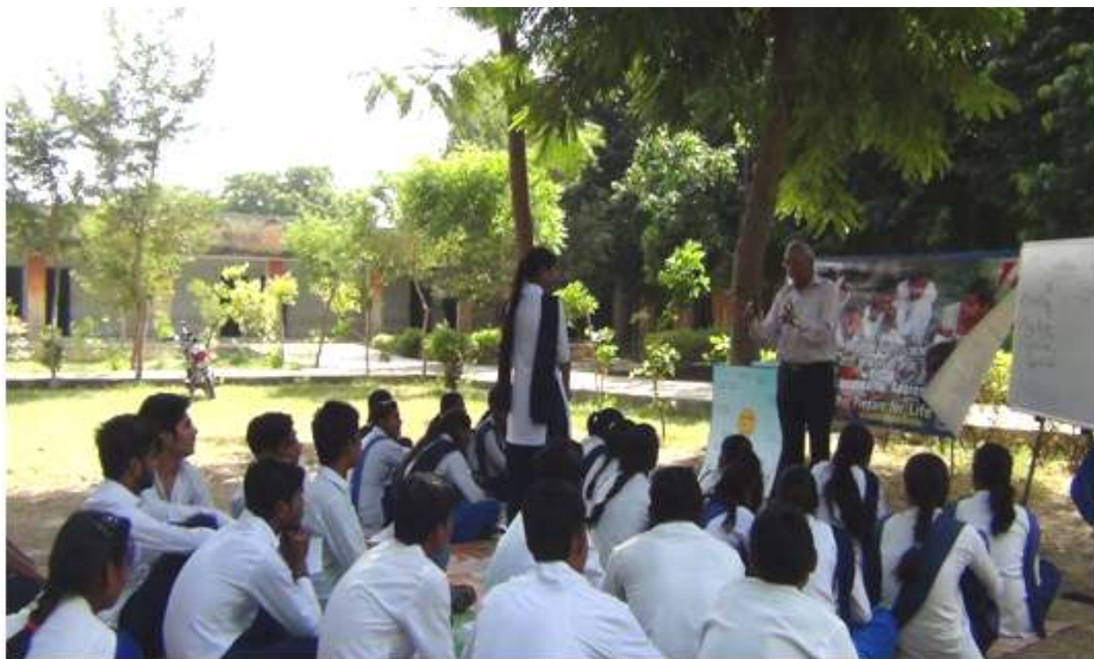
▲ Learning Life Skills in the Natural Environment

In each of the project schools, a three days workshop was held with the youth studying in Class 9, 10 or 11. Besides, separate workshops were held with parents and teachers on the fourth day. The workshop schedule moved from school to school decided in consultation with school and district department. It was astonishing to receive hordes of questions from the youth about self, family and others. The issues pertained to physical, emotional and social aspects of life particularly the changes that they experience in day to day life.