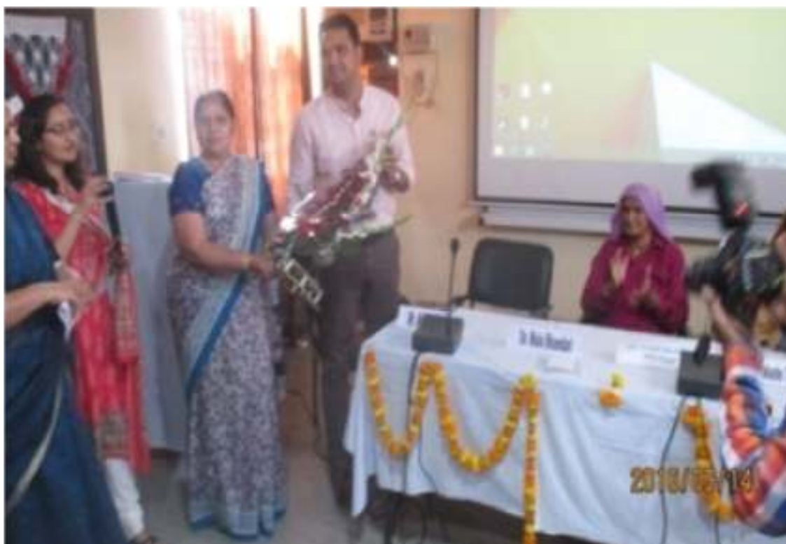
▲ Welcome by SDM, Dadri