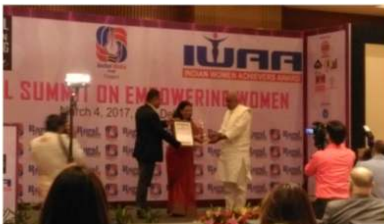
▲ The Director receiving the award