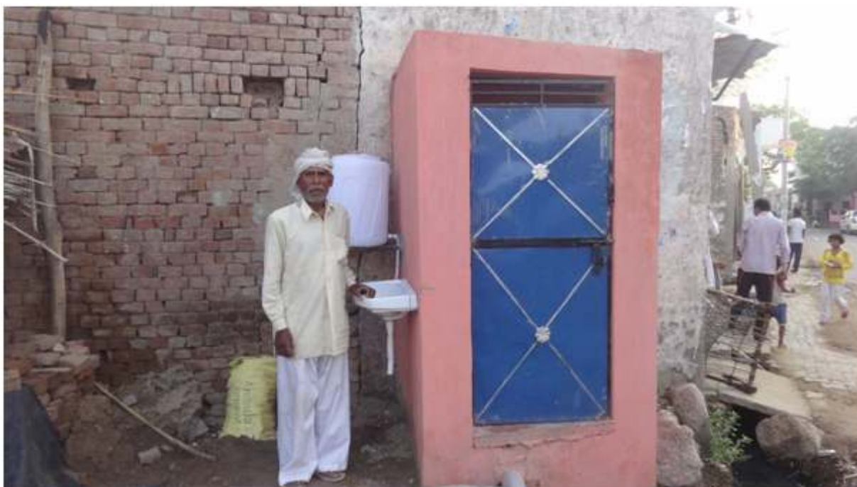
▲ A Household Sanitary Unit

the toilet for washing the hands after use. The feedback from people was quite positive and welcoming since the toilet was a long time need of the people.