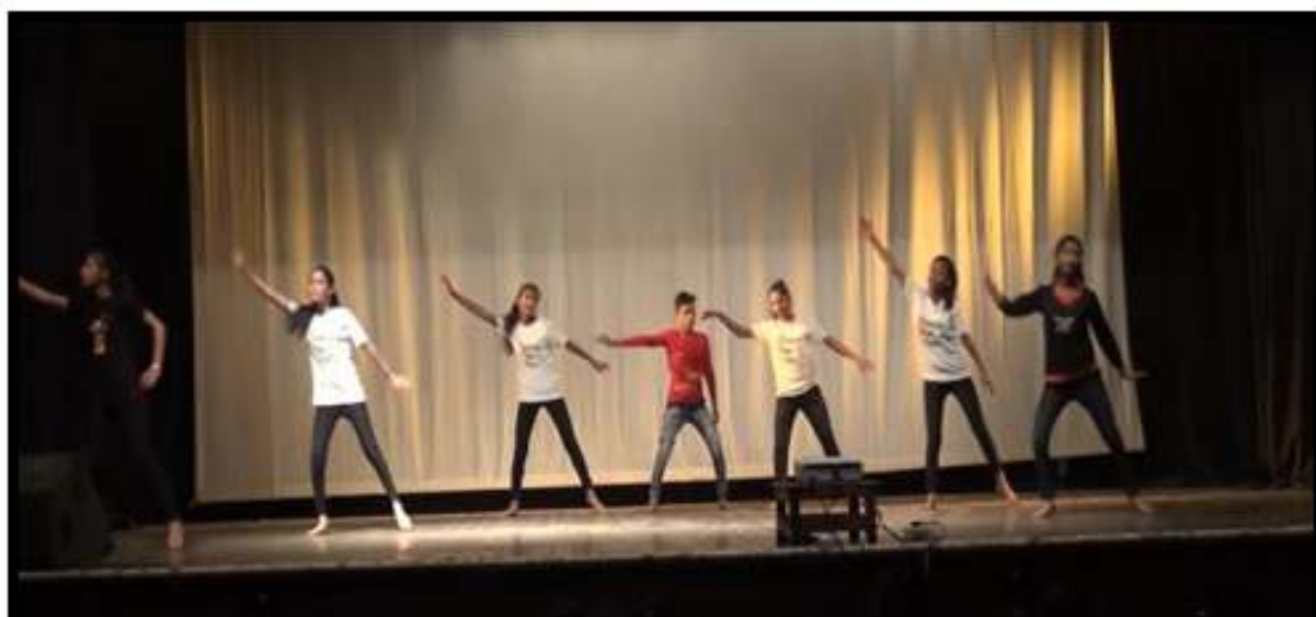
▲ Children perform at Kilkari