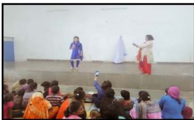
▲ Young Women take the Lead