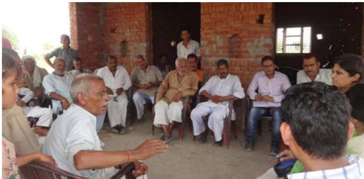
▲ The Village Committee

The Village Committee comprised local people from the community and the members of Gram Panchayat who had been associated with the project activities. Regular meetings were conducted where each one of the members put across their view point and collective planning was done to ensure efficient delivery and good quality of work.