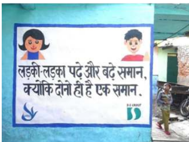
▲ Message on Community Walls

Besides the training workshops with children, we used various means to spread the message of gender equality in the community as an environment building endeavour. We used wall painting as a tool for community learning.