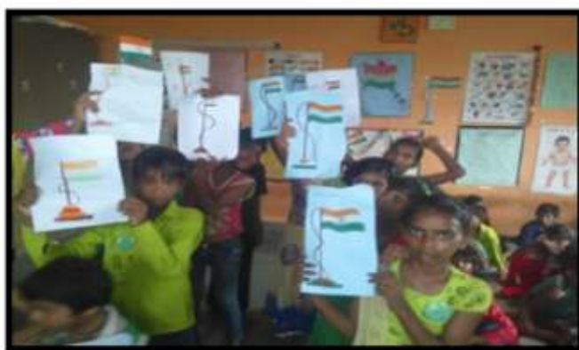
▲ We are the Children of India

The children made National Flag and coloured it. The assembly concluded with the singing of our National Anthem. Sweets were distributed among the children.