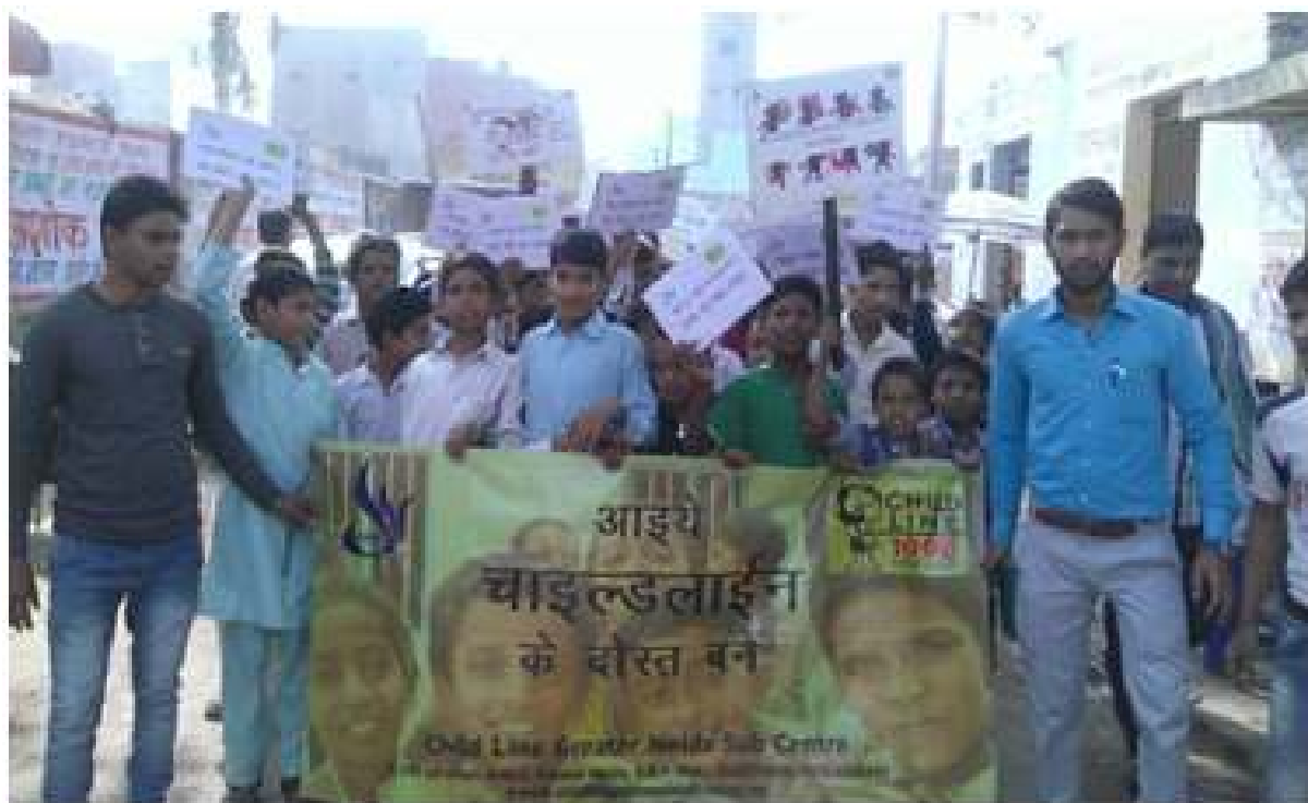
▲ Beginnning the Rally on Child Rights

The oath was taken with candles lit and held in hand. All the Child line members, children and other participants held candles and took the oath to reiterate their commitment to free our public and private spaces from child abuse and violence.