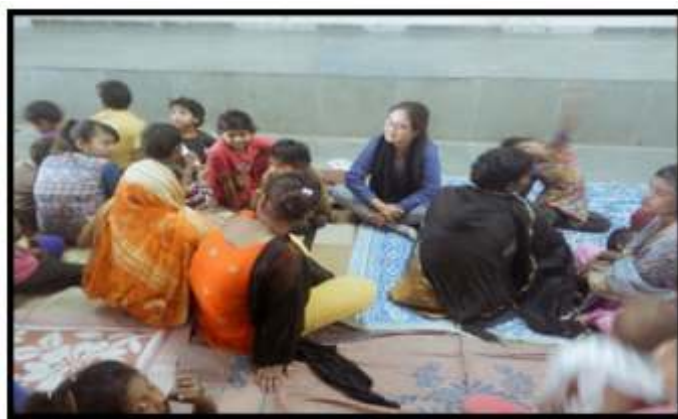
▲ Conversation with community women

We observed International Women's Day on March 8, 2017 with women in village Nithari. It was an occasion for women to express their self through nukkadnataks and poems written in own words. The day began with an interactive session on legal rights of women and how they can use various options for economic and social empowerment.