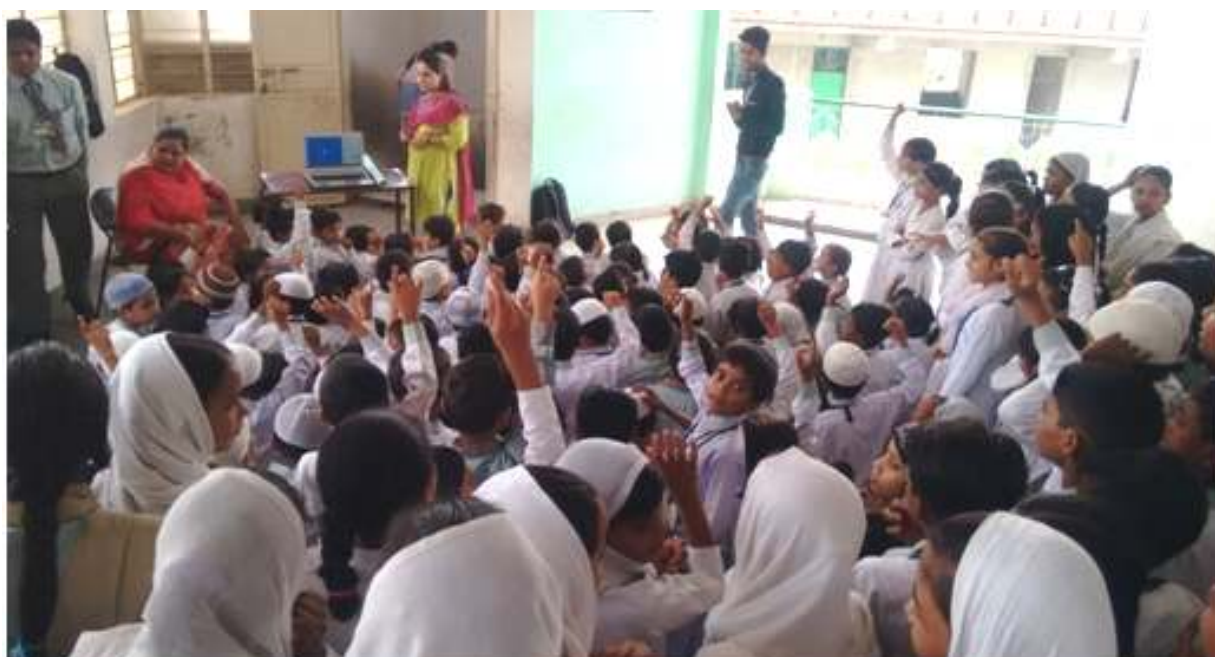
▲ A workshop in progress

The project followed the Training manual prepared for children along 4 main areas of understanding - The Self, The Friends/Peer group, The Family and The Community. These areas of understanding were essentially for children to identify the self in the context of sex and gender, relate the self to their immediate family and peer group through friendship and contextualise it all with the Community and its surrounding environment.