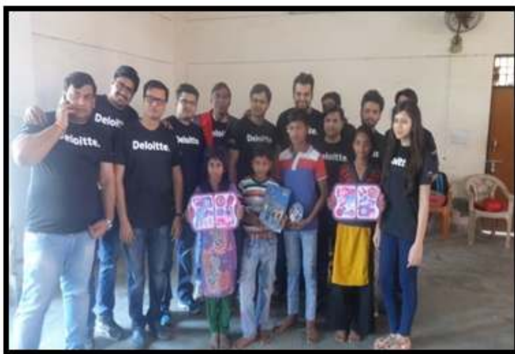
▲ Children with Dear Friends

The parting was sad and difficult for children when they had to say Good Bye to their friends.