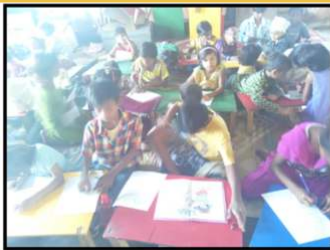
▲ During the Child Labour Workshop

During the workshop, the children were told about their basic right to food, play and school. They were happy to know that they had a right to play too. A nukkadnatak was presented by the children which showed how little children are sent to work rather than to school. Taking this opportunity, the Child Line Greater Noida team talked about 1098, the 24 hours Helpline for children in distress. The children were informed about its services and encouraged them to inform a child in any deprived situation.