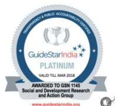
▲ Platinum Award from Guidestar India