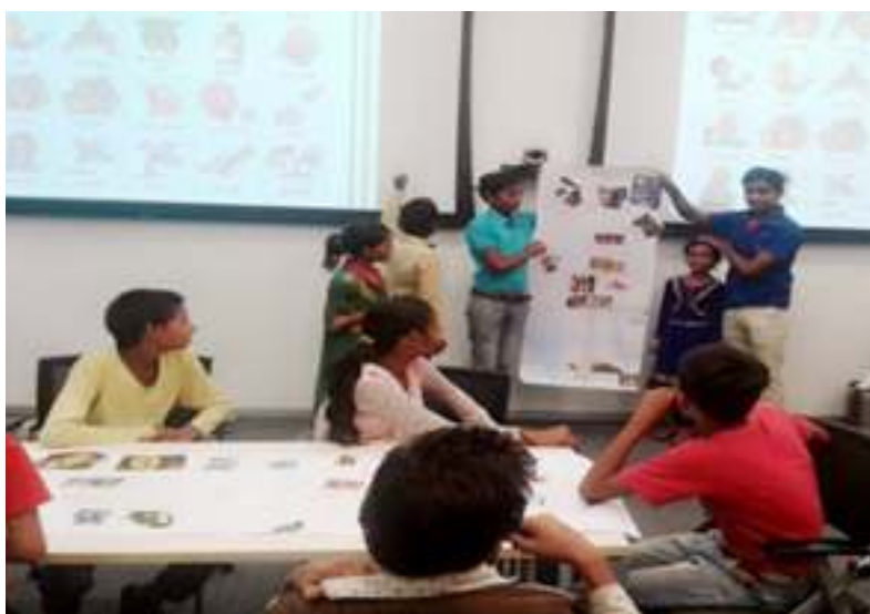
▲ Children learn about Health & Hygiene

On 21 September, Ugtasuraj children attended a fun filled workshop on Happy and Healthy Me. The volunteers of Adobe India taught children the effective habits through concept of