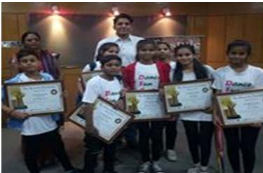
▲ The Children beaming with their Certificates

children received a thunderous applause after the performance was over. It was an enamouring experience that the children would never forget in life.