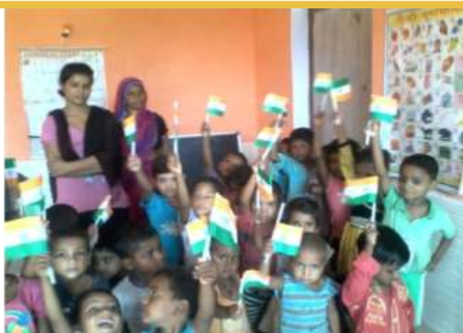
▲ Balwadi children in village Poothi

Children between 3 to 6 years need a conducive environment for their optimum physical, mental and emotional growth. Learning for them has to be ensured through a play way method. We are ensuring an enlightened environment for children through the concept of Balwadis which are open for community children everyday between 10 am to 1 pm. The facilitators in Balwadi belong to the local community and are well versed with the community way of life. They mobilise children, teach them at the Balwadi and get them enrolled in formal school available in the community.