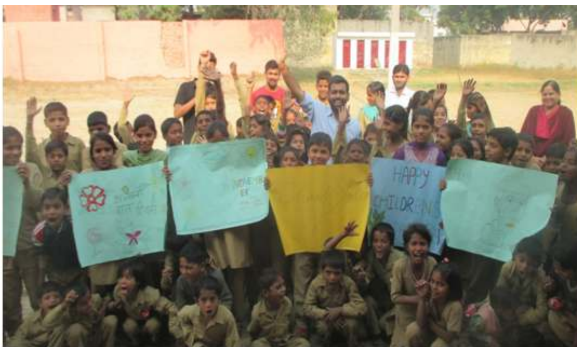
▲ Happy Children on Happy Children's Day