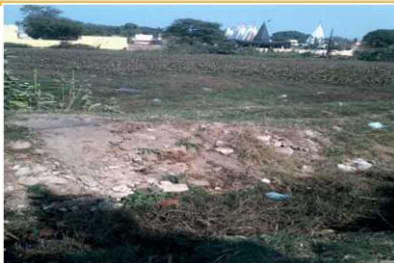
▲ Water Body: A Dump yard!

We broadly followed the Govt. of India guidelines on measurements of toilet building. However within the given cost, we slightly extended the size to make it more user friendly. A water tank was installed for availability of water in the toilet. A small size washbasin was put up outside