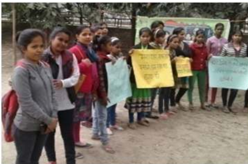
▲ Rally in the Public Park at Noida

The children took an initiative and went around in the park telling people to throw paper and covers of food packets into the dustbins. They held posters that gave message on importance of maintaining cleanliness around us. Similar kind of campaigns were organised at PariChowk and village Tughalpur in Greater Noida.