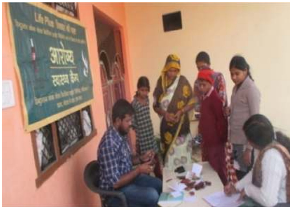
▲ A Health Camp in progress

During the year, a total of 16 health camps were held in 4 villages: Kakrana, Galand, Poothi and Nandpur. Around 843 people availed the services available in the camps. Of the total, around 60% were women who availed the health camp services. Women in particular, availed health camp services more regularly than men. They consulted the doctor for personal ailments as well as for their children.