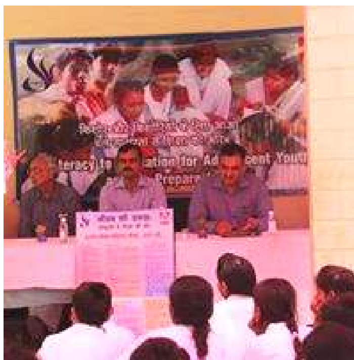
▲ Launch Program of Life Skills Project