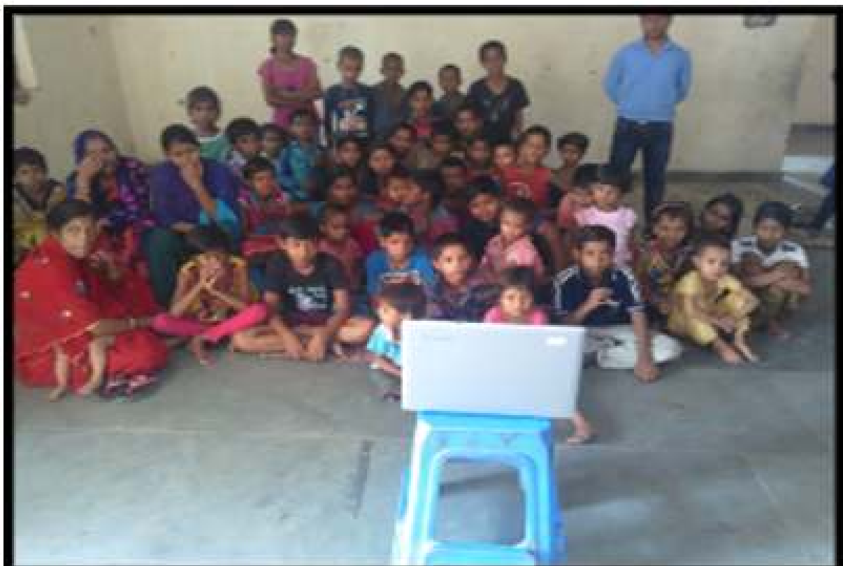
▲ Watching Komal: the Film on Child Protection

The Child line team organised an Open House session with children and their parents in Navada center on 9 June 2016. A talk was held on child protection issues such as child marriage, violence and child abuse. The focus of the talk was on prevention of child abuse.