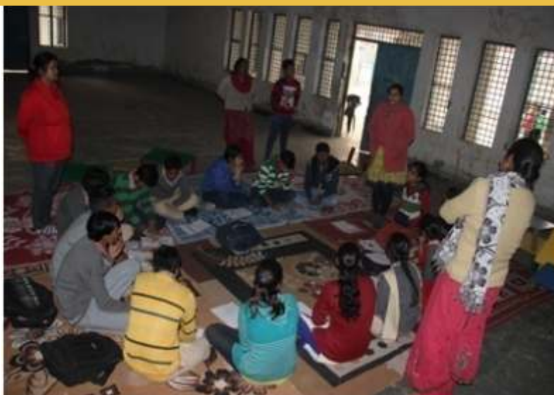
▲ Group Learning in an AYV Session

Media Link: https://youtu.be/1O_3pbFbCdc