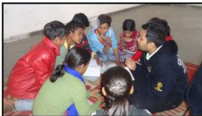
▲ After School Coaching by IMT Ghaziabad Volunteers

Those in need of subject coaching were taught after school by the volunteers of Institute of Management and Technology, Ghaziabad. They visited every Saturday and taught children in group as well as on one to one basis.