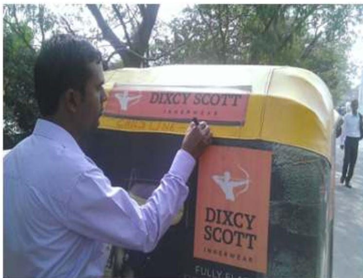
▲ Highlighting Child Line behind Auto rickshaws

On 14 November, we organised Child line Se Dosti Corner at PariChowk which is the entry point to Greater Noida. The team members went around and spoke to people there. Many people approached the Child line desk put up in the corner to know more about it. The auto rickshaw drivers were very supportive and they got written Child line 1098 at the back side of their autos. The Child line stickers with complete address and contact number were pasted inside the state transport buses.