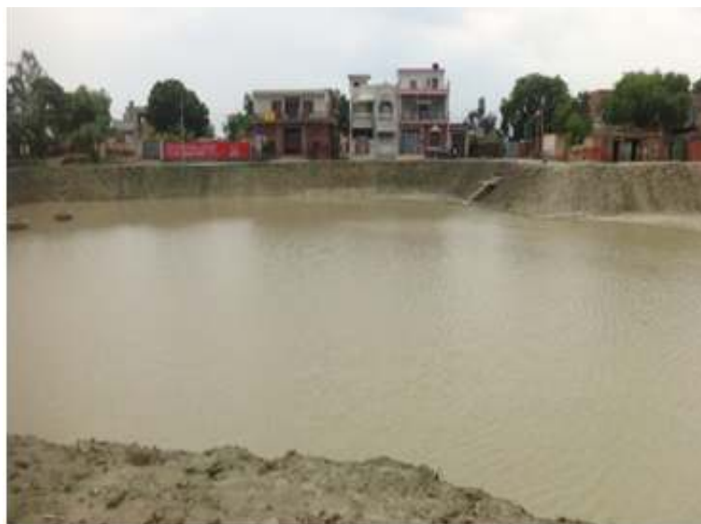
▼ The Rejuvenated Water Body