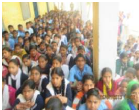
▲ Road Safety workshop in School