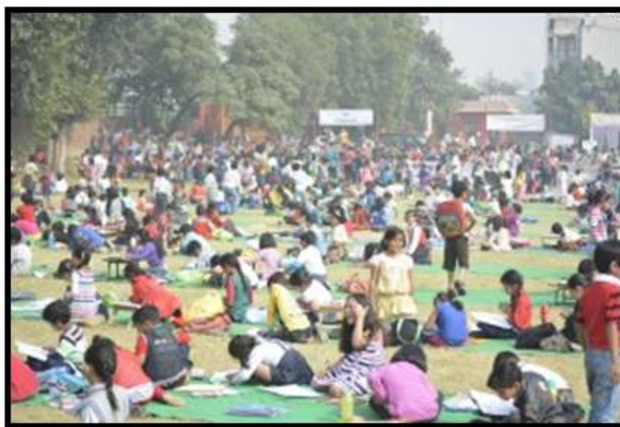
▲ A Riot of Colours at Rang Bharo

On 20 November, The Chinmaya Mission, Noida organised Rang Bharo, a painting competition for children at VishwaBharti Public School, Sector- 28, Noida. A total of 2500 school children from 20 different schools of Delhi-NCR region competed with each other trying to give the best.