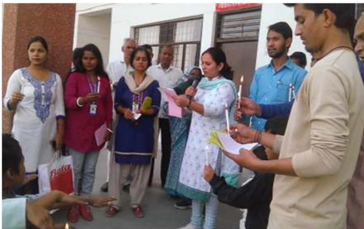
▲ Oath Taking Ceremony

To strengthen the spirit of cleanliness in public spaces, we conducted Swatch Bharat Abhiyan campaign on 21 January 2017. Together with Childline Noida and Dhankaur and other NGOs, a cleanliness activity was organised with children in a park situated in Sector-15A, Noida. The children were divided into groups and all Gloves were distributed among the children. The collected garbage was properly thrown into the dustbins installed in the park. cleaned the park together. Information on keeping hands clean was given to children.