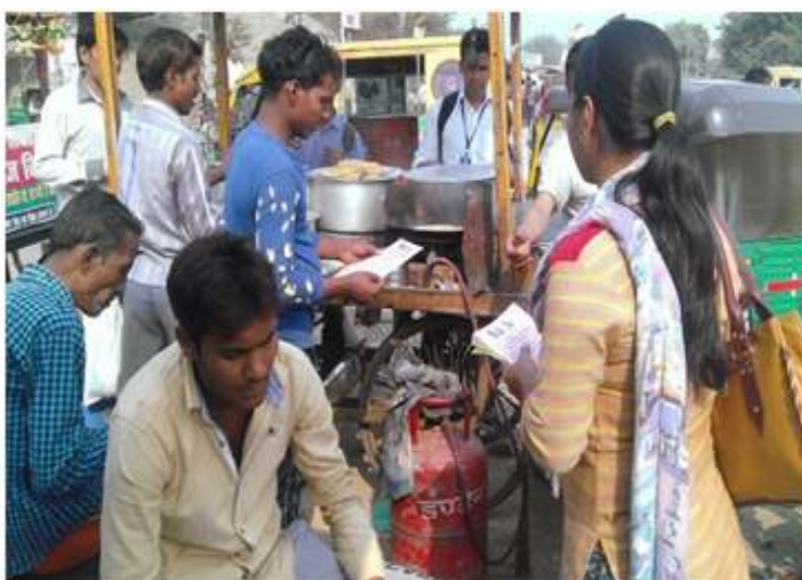
▲ For No Child Labour in road side food stalls

The Childline team members went around in local markets and distributed Pamphlets among the people. The people working on road side stalls were spoken to for not employing children for work.