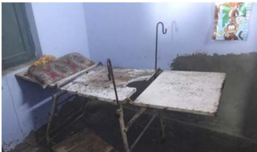
▲ Pathetic condition of PHC village Saunda