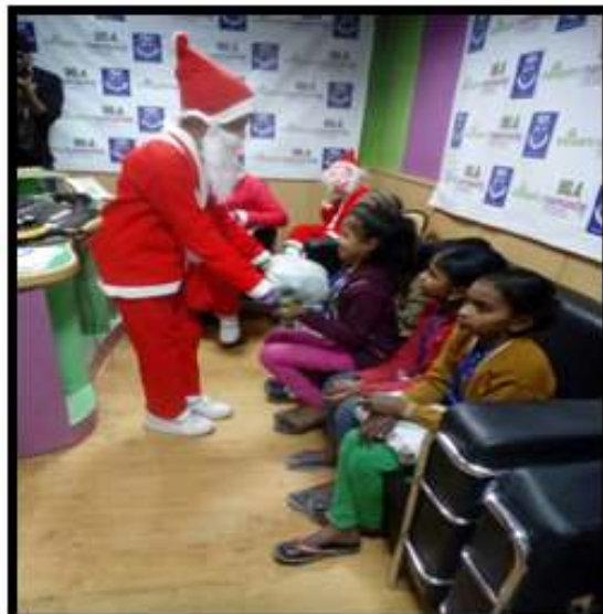
▲ Santa All the Way!