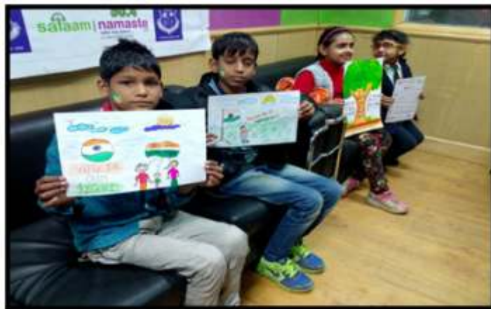
▲ Children draw their Imaginations

In Election time, people exercise their power by voting to elect their political representative. In one such program organised by Salam Namaste, the Community Radio, Noida, a Slogan and Poster making competition was held on 24 January on the theme of "Importance of Vote and the Voting". Children from different private schools and other organization participated in the competition.