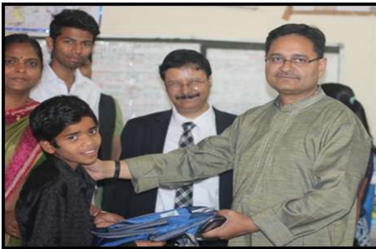
▲ School Bags Distribution among children

The volunteers of DassaultSystemes Group experienced the same emotion when they gave school bags to Ugtasuraj children under their CSR initiative.