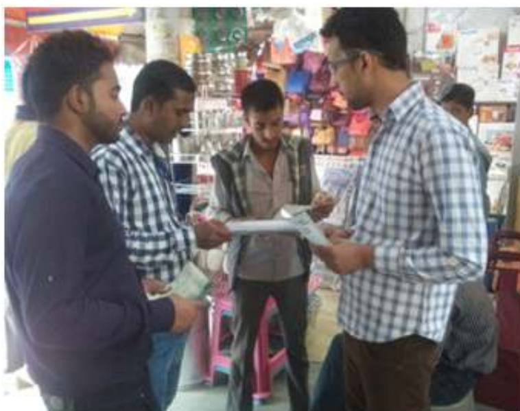
▲ Sharing Information on 1098

The Child line members, volunteers and community people went as a team to public places such as markets, metro stations, bus stands and spoke to people on Child line 1098 service in the district.