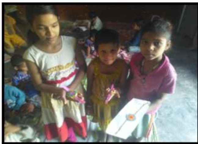
▲ Showing off the Rakhis

To celebrate this festival, a Rakhi Making activity was organized for UgtaSuraj Children on 25 August. Children made beautiful Rakhis using different items like silken thread, ribbon, beads etc. Their artisanship was quite fascinating and children thoroughly enjoyed this activity that tickled their creative side.