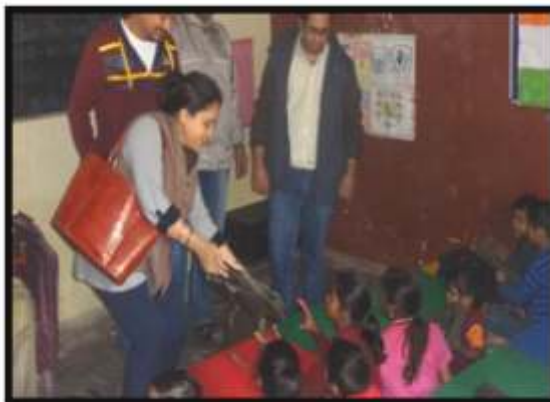
▲ Children having fun with volunteers team

Xmas continued. On 24 December 2017, Christmas was celebrated in all the centres. The children decorated Xmas tree with colourful paper balls and stars. Children made Santa Clause using the craft material. Song and dance competitions were organised. The day culminated with distribution of chocolates among the children.