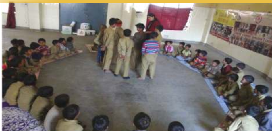
▲ Role Play in School