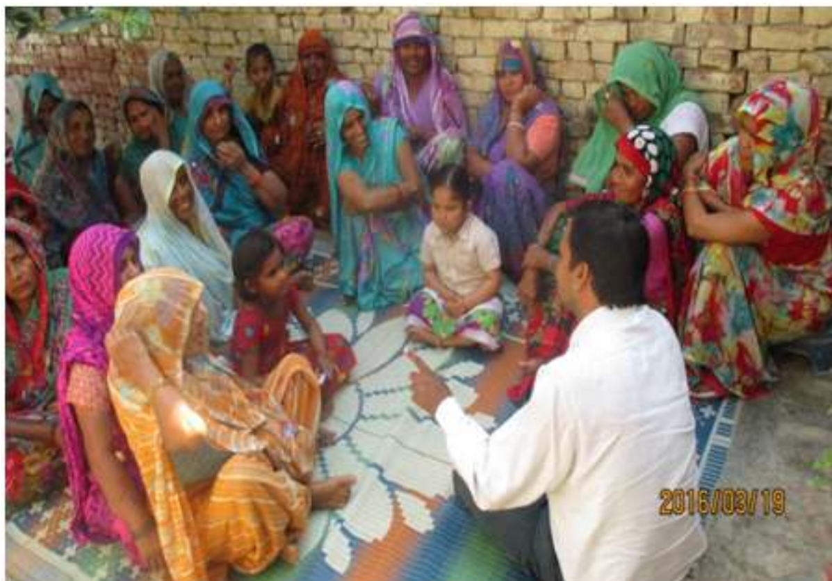
▲ SHG women training, Village Kakrana

Sarthak is an initiative to empower community women through skill development and economically gainful activities through SHG mode. The women are provided training in marketable skills and are encouraged to start micro-enterprise of their own. The women have been provided training in stitching & tailoring, artificial jewellery making, potli and paper bags making, crafts work and decorative candles making.