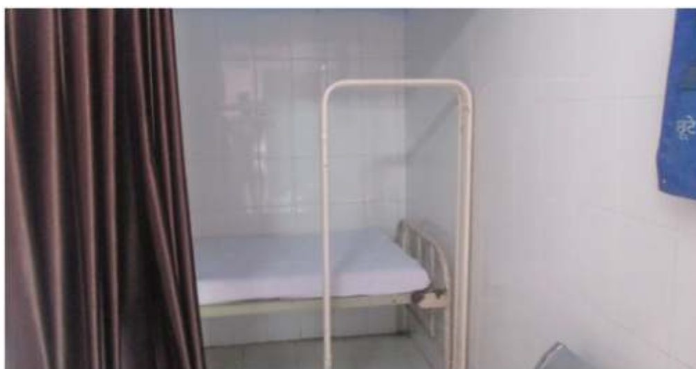
▼ The Clean PHC after work was done

For the conduct of medical care, necessary equipment was provided such as Blood Pressure machine, Stethoscope and various other diagnostic tools that are required to diagnose the nature of an ailment. The important infrastructure for patient care was provided. A proper bed with mattress and clean bed sheets was provided for in-house patient care. The chairs, tables, stools and almirahs were procured for the proper functioning of the center. The stretcher was provided for ferrying the patients from one place to another. There was no provision for privacy to women at check up and delivery time. Therefore curtains were put up to mark private screening and treatment areas at the center.