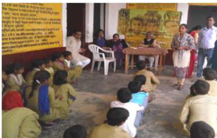
▲ Awareness Session on Child Line 1098

Later informal interactions with children were held and it was discovered that the school had no