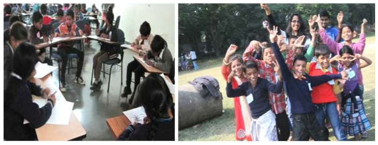
Children busy with their drawing sheets at IMT, Ghaziabad

On 17<sup>th</sup> November 2013 The Make A Wish Foundation, Institute of Management Technology, Ghaziabad invited Ugta Suraj children for a fun filled day. The college students had planned the Day into various fun and skilled activities along with outdoor games and matches. Around 95 children went to Ghaziabad in a big bus,