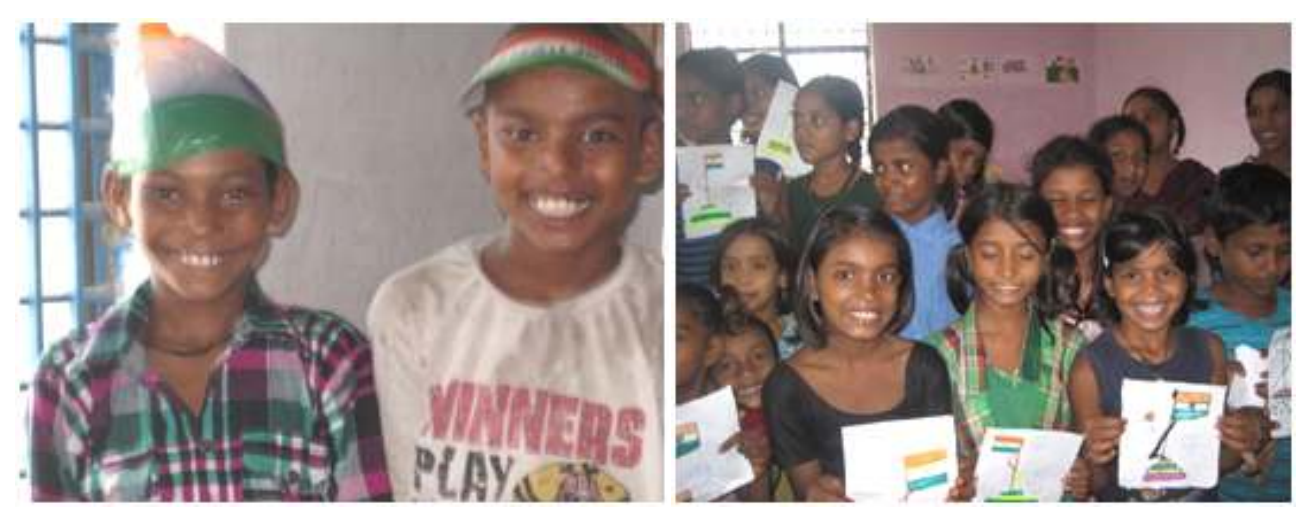
Children at Nithari Centre

The Independence Day was celebrated on 14<sup>th</sup> August 2013. The children were told stories of our great freedom fighters. The children sang and danced at their respective centers. They made The National Flag and Gandhi Caps with paper and colours.