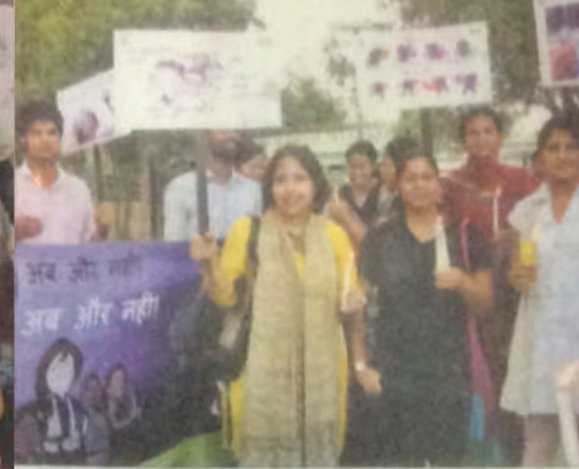
SADRAG took out a rally against sexual violation of children.