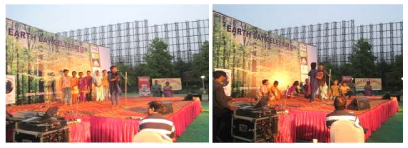
Save Water – Street Play

Local panchayats and social organizations observed the Earth Day on 22 April 2013 at the famous Noida Stadium, Sector-25, Noida. The main theme of the event was NO PLASTIC USE. The health providers from government and private hospitals participated in the event along with hordes of community people. On this occasion, Ugta Suraj children presented a street play on Save Water .