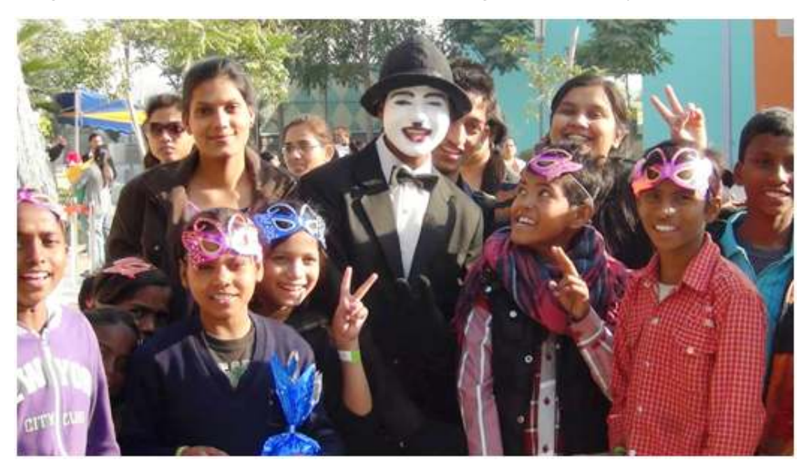
Children at World of Wonder, Noida ... ... ...

On 24 December 2013, Christmas was celebrated in all the centers. The children made Xmas cards with colours and paint. They made Christmas tree and decorated it with paper balls and stars. They made cut outs of Santa Clause and painted them. Song and dance competitions for children were organised. The day culminated with