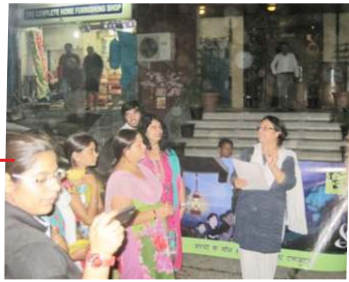
Child Protection Oath administered by Director in Tughalpur market area