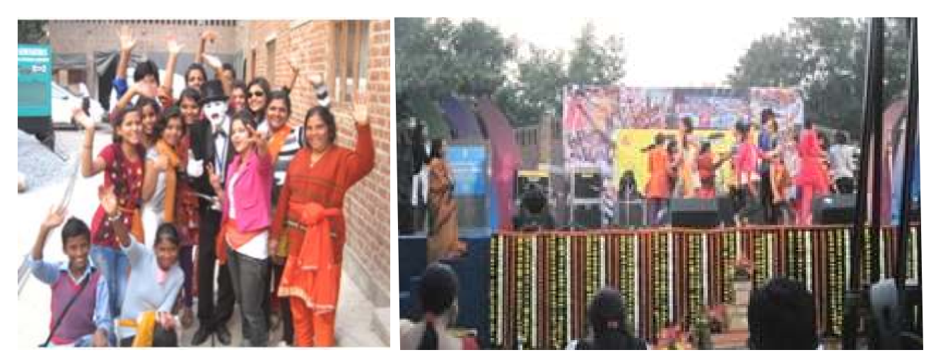
Ugta Suraj children at Vatsalya Mela, New Delhi

children performed a street play on Violence against Women . Through this play the children talked about the gender discrimination prevalalent in our homes and its implications over the women and young girls in her own community and the society at large.