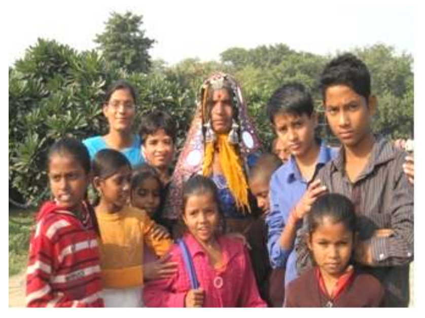
Children at Gandhi Darshan, Rajghat, Delhi

On 21<sup>st</sup> November 2013, Ugta Suraj children visited Gandhi Darshan at Rajghat , New Delhi to attend the cultural show where the children from diverse backgrounds from across the country come to participate.