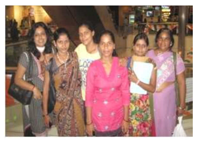
Ugta Suraj Facilitators at The Great India Place, Noida

On 20th August was celebrated the festival of Raksha Bandhan. The children were told the importance of this festival and were also told the mythological story behind it. On this occasion, girls and boys made rakhis with colored paper, decorative material, ribbon and cloth.